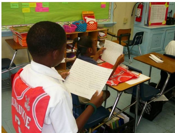
Students at Pierre Capdau-UNO Charter School read letters from their Milwaukee pen pals.